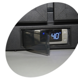
Protective thermostat cover