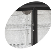
Door holder for loading of the cabinet