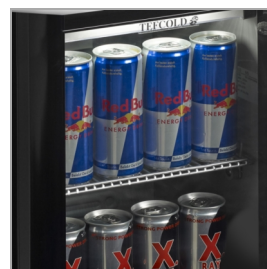
Designed for Energy-cans