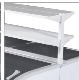
Promotional shelves as accessory