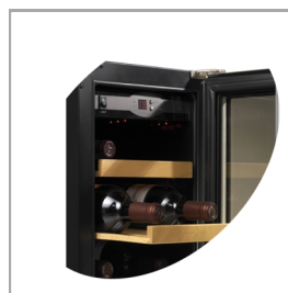
Wooden drawing shelves