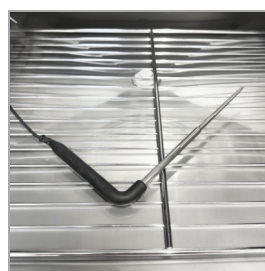
Core sensor included