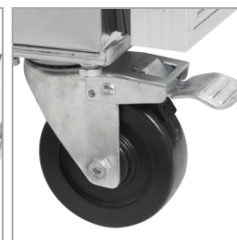
Strong castors as option