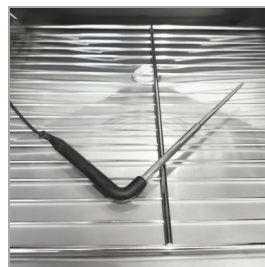
Core sensor included