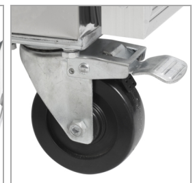
Strong castors as option