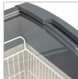
Frameless curved sliding lids