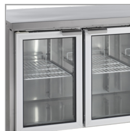
Aluminium door frames and LED light