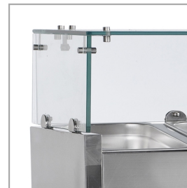
Glass structure for protection of food