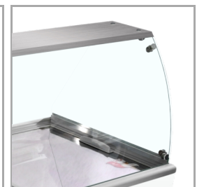
Curved glass for nice presentation