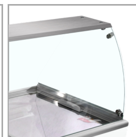
Curved glass for nice presentation