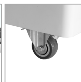
Castors with and without brake