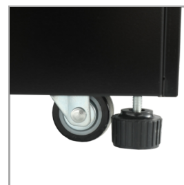
Castors and locking feet