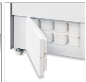
Easy access storage compartment