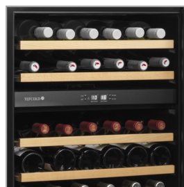
Wooden drawing shelves