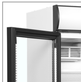
LED light inside door frame

The CEV range is available in white or black color options, with a right-hand hinged door or left-hand hinged door, and with or without a canopy. Upon request and at an additional cost, this product is also available with an EU energy rating C. Contact our sales team for more information.