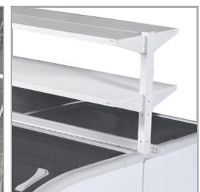
Promotional shelves as accessory